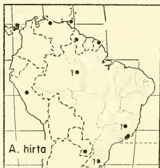
Map 1. Distribution of Achaearanea hirta (Taczanowski).

36. Total length of females 1.9-2.9 mm. One female from Panama, total length, 2.6 mm. Carapace, 0.98 mm. long, 0.77 mm. wide. First femur, 1.82 mm.; patella and tibia, 1.80 mm.; metatarsus, 1.80 mm.; tarsus, 0.66 mm. Second patella and tibia, 1.17 mm.; third, 0.78 mm.; fourth, 1.24 mm.